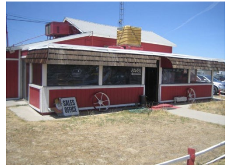
The original location of Ernie McBride's used car lot at 43813 Sierra Highway.